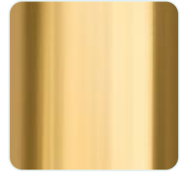
Bright gold look